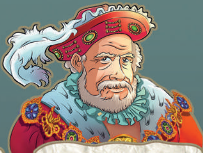
King Henry VIII

... is a common boy who looks very much like Prince Edward. He lives in one of the poorest parts of London, where his father makes him beg in the streets. He is a good boy who dreams about living like a prince.