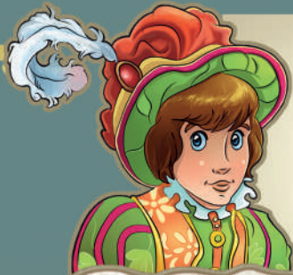
Edward Tudor, Prince of Wales

... is the son of King Henry VIII. He lives a rich life inside the royal palace, but has no freedom. He is a kind and fair boy, but wishes he could be free and play in the streets like a simple child.