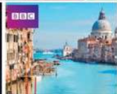
FRANCESCO'S VENICE p16

SPEAKING 1.1 Talk about names 1.2 Discuss the results of a personality test 1.3 Speculate about people based on their portraits 1.4 Describe a treasured possession