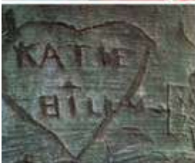
WHAT'S IN A NAME? p8