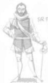
SIR FRANCIS DRAKE

Although Sir Francis Drake enjoys legendary status in Britain today, he is a real historical figure. The fleet sent by King Philip II of Spain to invade England in 1588, known as The Spanish Armada, is also fact, not fiction. Here is a short introduction to the most important people involved in this dramatic episode of European history: