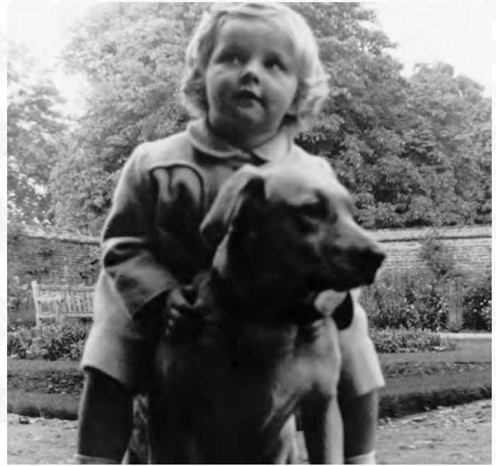
In the family garden