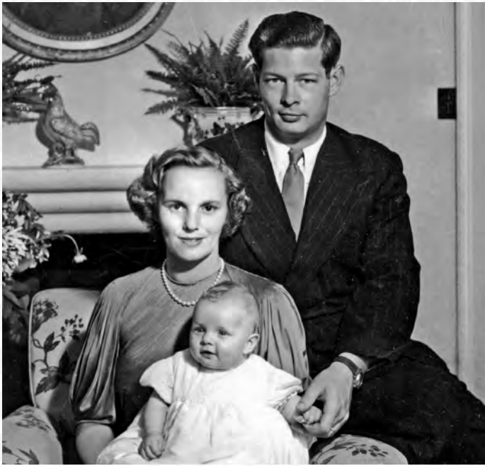
With King Michael and Queen Anne