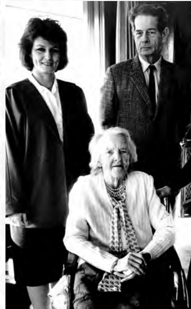
With King Michael, Queen Anne and her maternal grandmother, Princess Margaret of Denmark