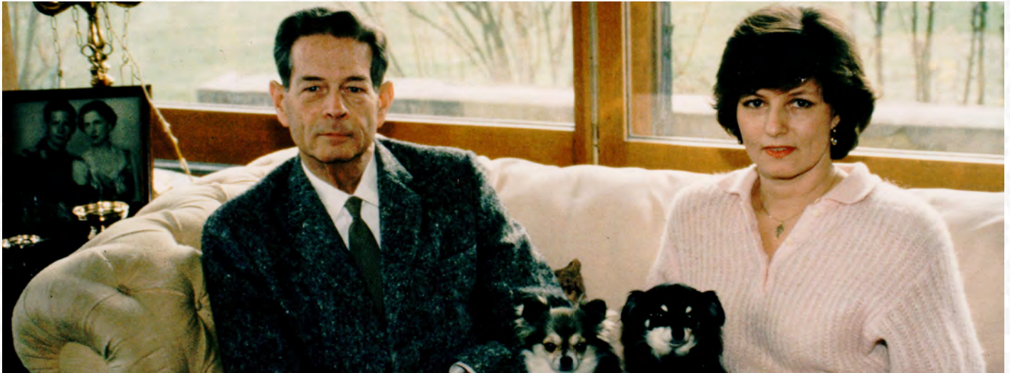
With King Michael, Versoix