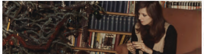
Various photographs of the Princess