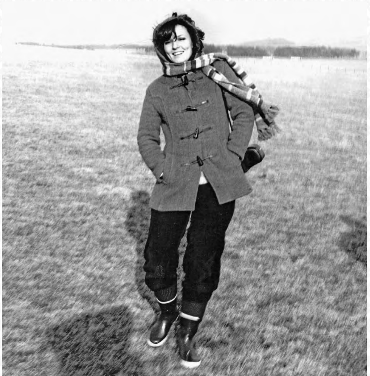
During her student years at Edinburgh