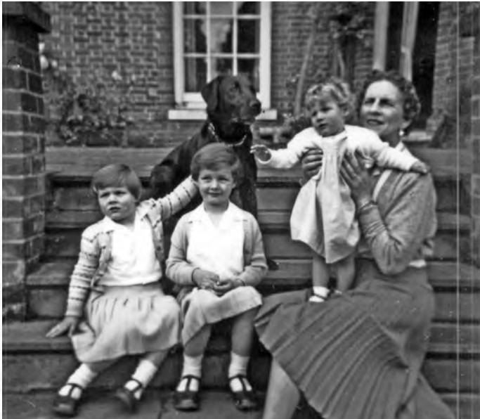
With her paternal grandmother, Queen Helen, and her sisters, Their Royal Highnesses Princess Helen and Princess Irina