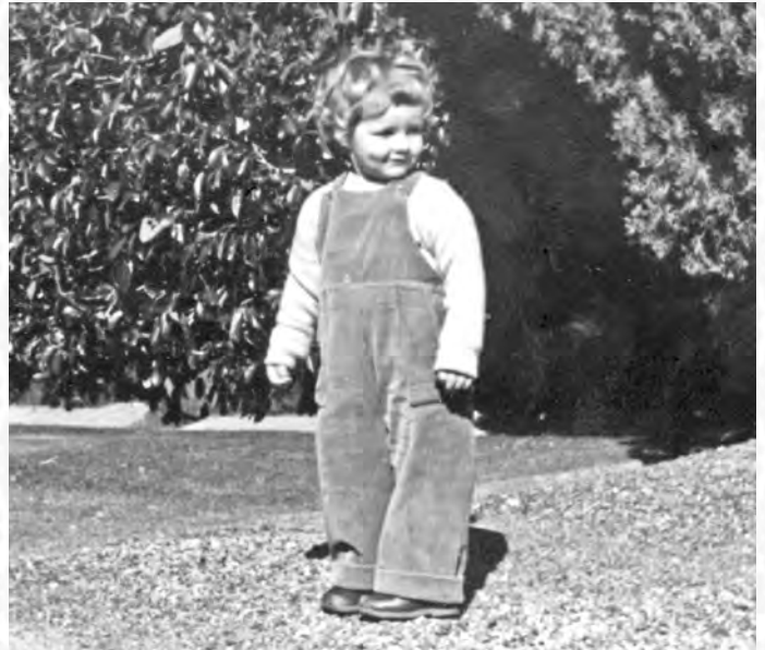
At Villa Sparta