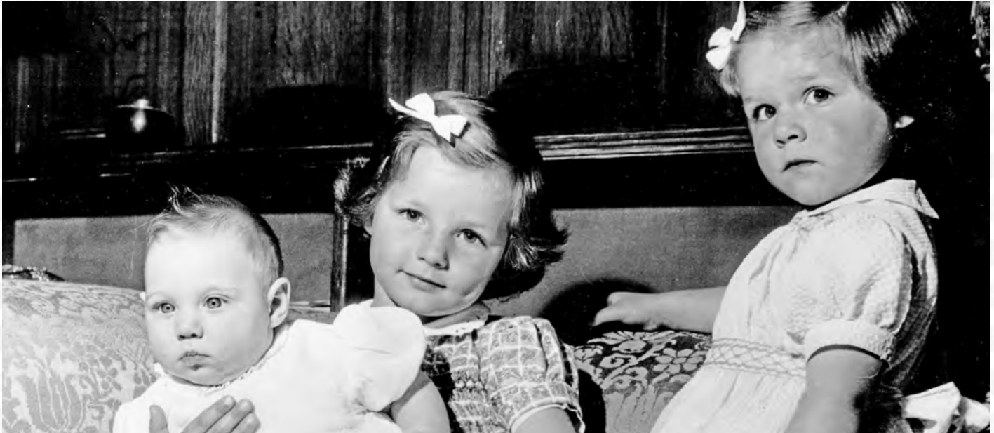
With Princess Irina and Princess Helen at Villa Sparta