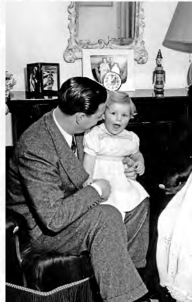
With King Michael and Queen Anne at Princess Helen's baptism