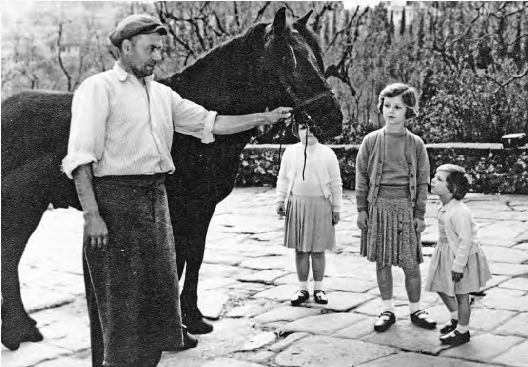
With Princess Helen and Princess Irina at Villa Sparta