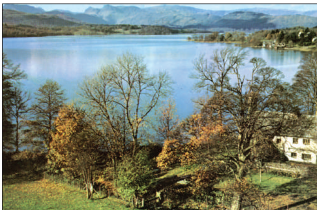
The Lake District – Lake Windermere