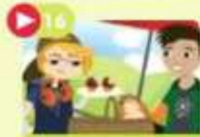
3.16 Grammar animation