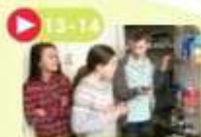
3.14 Grammar video