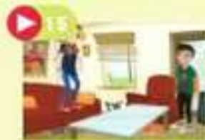
3.15 Grammar animation