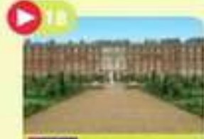
3.18 Culture video