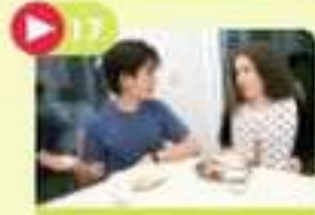
3.17 Communication video