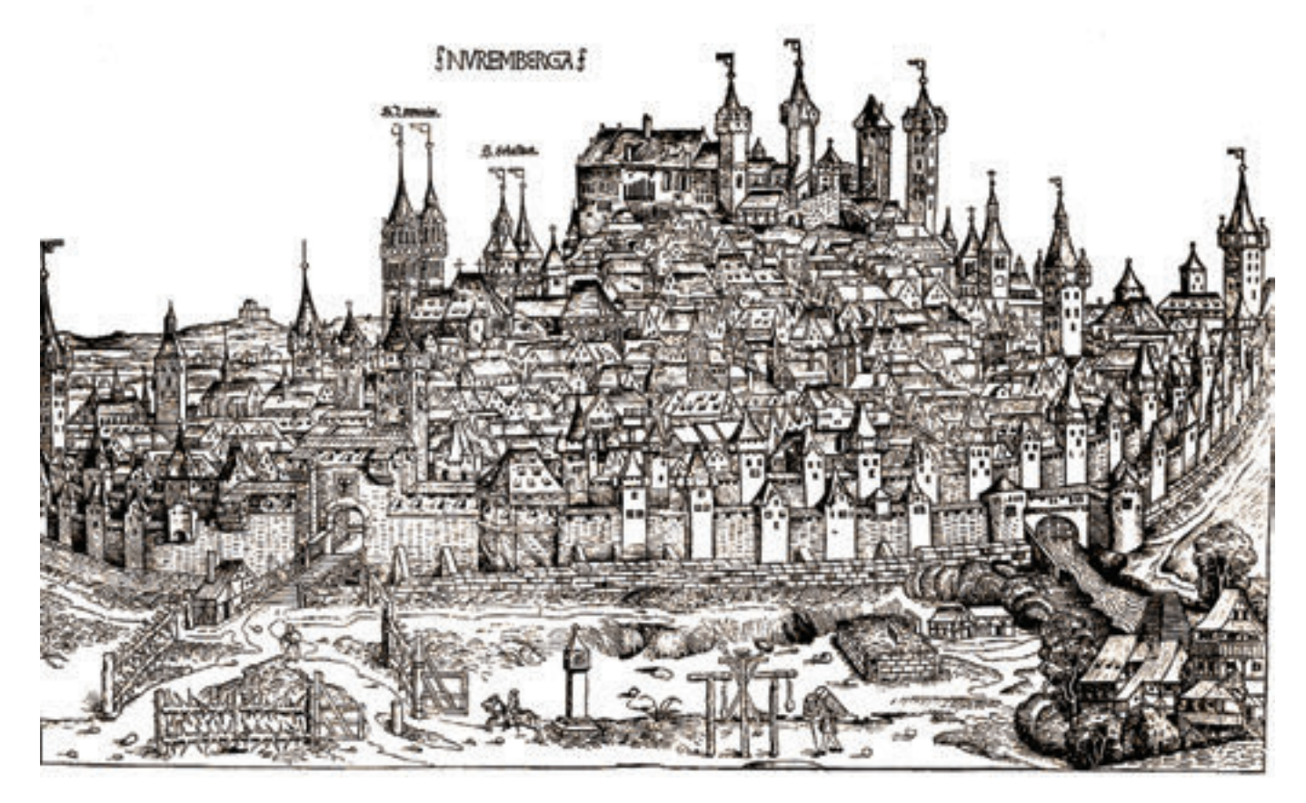
The city of Nuremberg – period engraving (fifteenth-century). On 8 February 1431, in the city's cathedral, a ceremony took place to receive Wallachian Prince Vlad into the ranks of the Knights of the Order of the Dragon.

Prasnaglava, which in Slavonic means "empty-head", in other words "Radu the Stupid"!